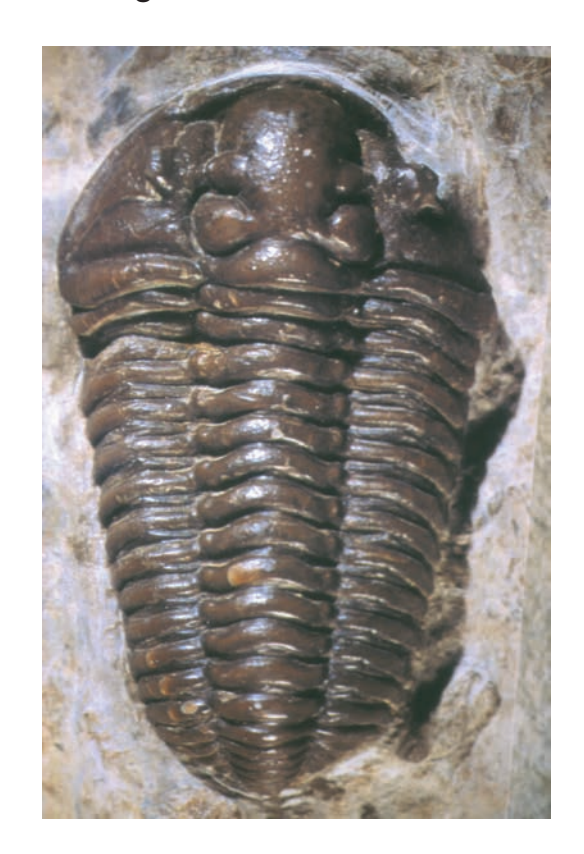
Trilobite - calymene blumenbachii