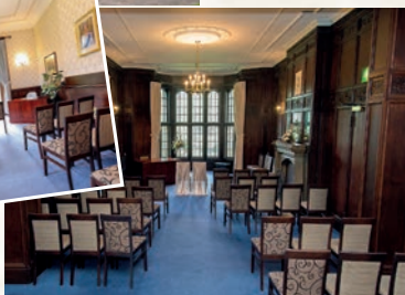
THOMAS ROBINSON BUILDING, Stourbridge