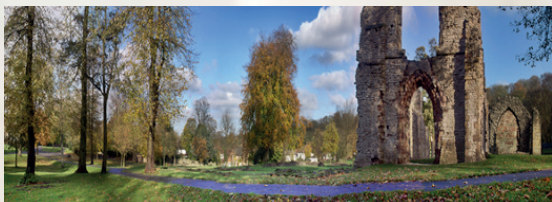
PRIORY HALL, Dudley